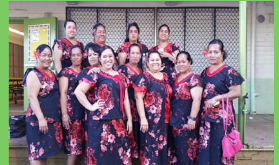
Island of the sleeping lady